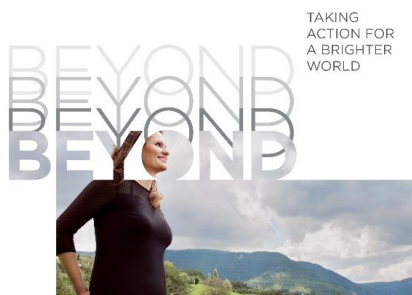
Fig 5: Participants can attend the first-ever sustainability breakout session at DS World 2022 – providing insights on what sustainability means for the dental industry and concrete actions dental professionals can take to become more sustainable in their practice.