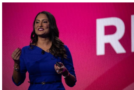
Fig 4: Top women dental and business experts will make up 50 percent of the main stage speaker program – a milestone achievement at DS World 2022.