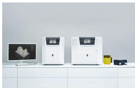
Fig 3: Early testers have identified Primeprint Solution as an easy way to add 3D printing to their dental practice. Clinicians can try the latest system – and more – at the main exhibition hall.